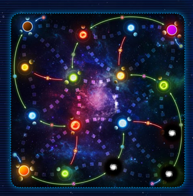
Sample board setup in a three-player game.