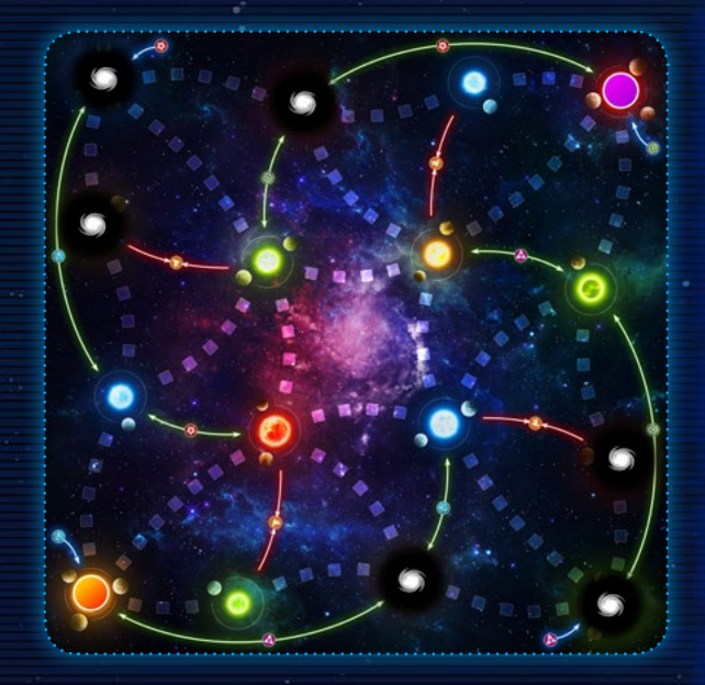
Sample board setup in a two-player game.