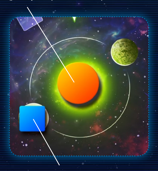
A planet in the system (settle it using one of the drawn resources).

Green star system (place your space base here).